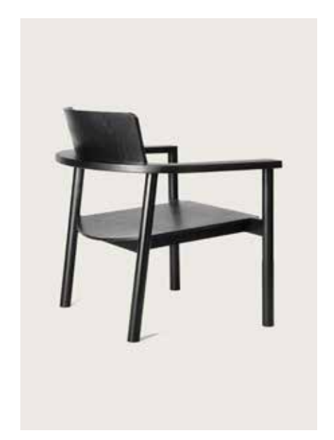
RUDI LOUNGE ARMCHAIR