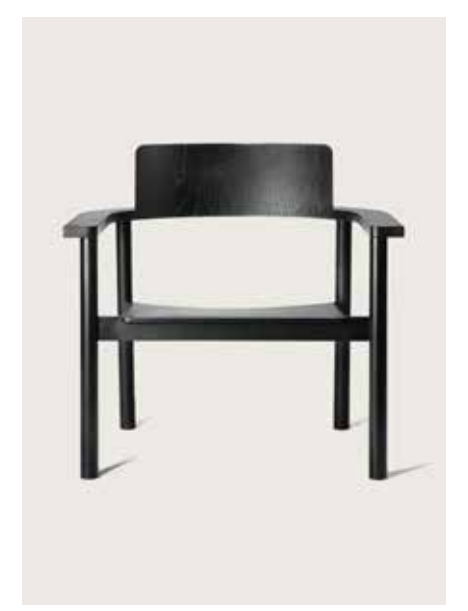
RUDI LOUNGE ARMCHAIR