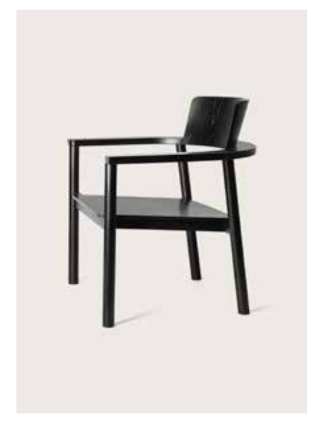
RUDI LOUNGE ARMCHAIR